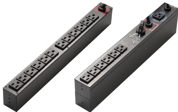
Optional FlexPDU and HotSwap MBP for greater flexibility and uptime